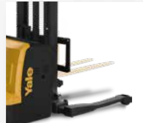
Adjustable Straddle legs