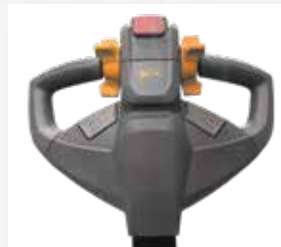
Tiller Handle (standard) (Left & Right Handed)